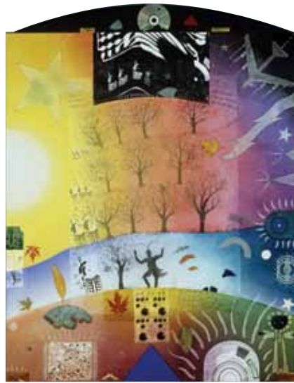
Synchronous Forest / West acrylic, papers & objects on canvas 50" x 42" 1998