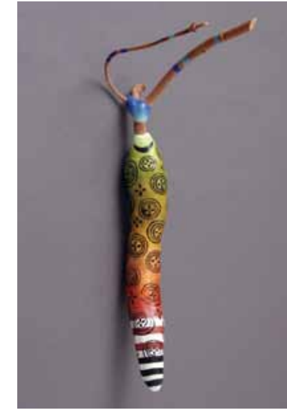
Royalty of the Dance acrylic and paper clay 18" x 10" 2007