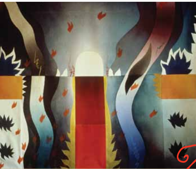
The Warrior (Lotus) acrylic on canvas 56" x 68" 1986

ah ~ i see an artist's palette! infinite plains : irrigation circles ~ fertile greens, golds, bronzes. masses of pyramids : purples, indigos, snows ~ silver and gold hidden deep ~ waters satin, diamond, jade ~ red sandstone, wild against sky. a bowl of cerulean : overarching all ~ deepest ultramarine at the top ~ at night, singing with stars!