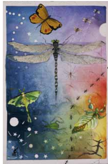
Scintillating watercolor and inks 22" x 15" 1998