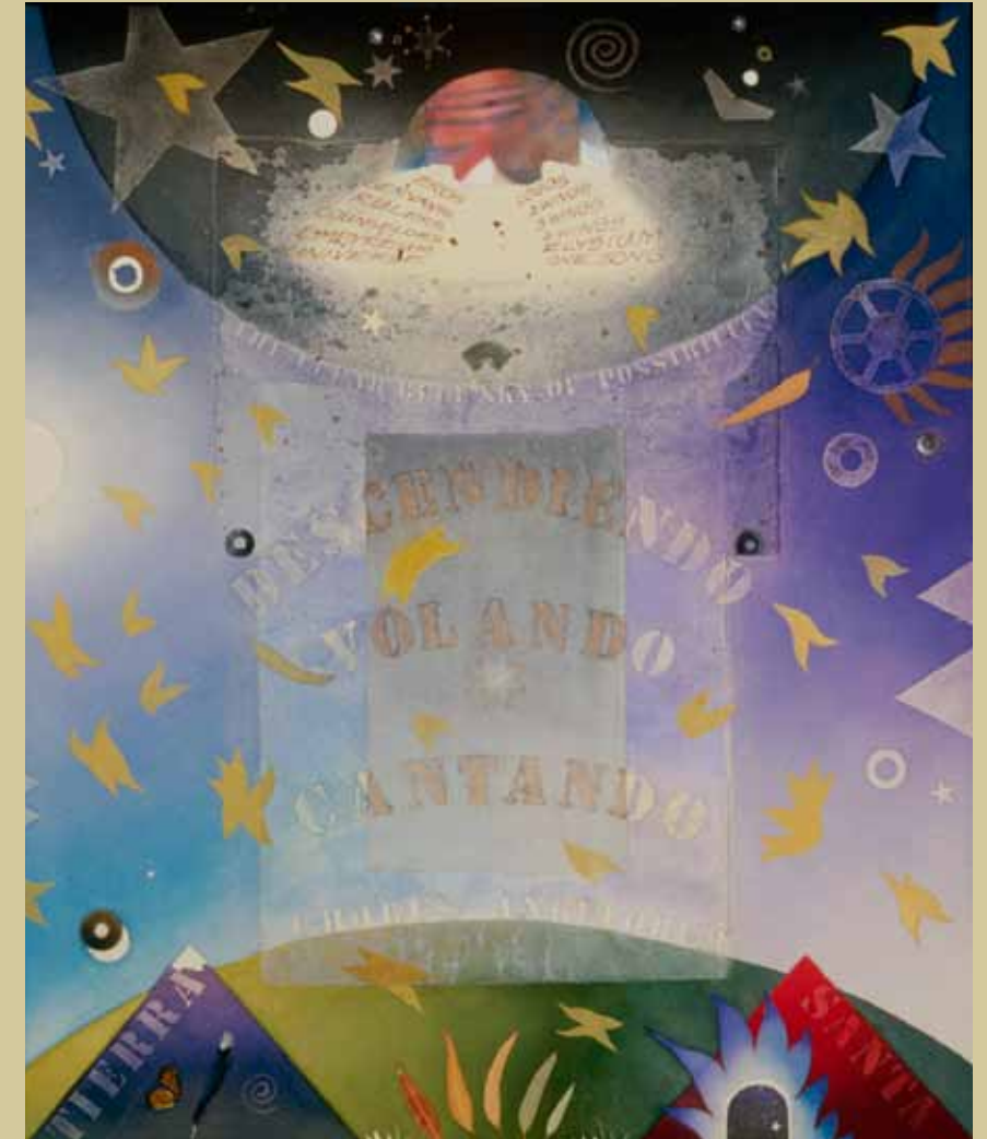
Flying, Descending, and Singing I acrylic, found papers & objects 50"x 42" 1994

2010 Featured Artist, Women Moving Millions Conference, Denver, CO 2007- 2010 Beautification, Safety, and Pride Committee, Federal Boulevard Project 2003 Co-Originator of North Denver Artist Studio Tours 1997-2002 Painted Live “The Four Seasons” with The DSO and David Taylor Dance 1993-2000 Performer of West African Music, Kusogea Nobu Drum Ensemble 2000-2001 Fore Fote Drum and Dance Camp, Republic of Guinea, West Africa 2004-2013 Performer of West African Music, “Baba Joda and Friends”