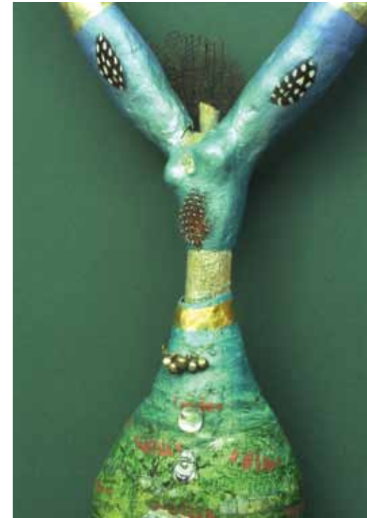
Fauna, detail acrylic and paper clay 28" x 18" 2005