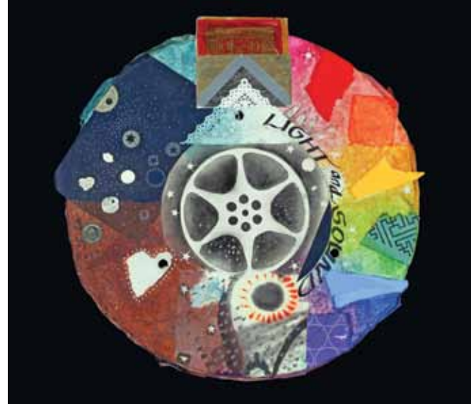
Light and Sound acrylic on paper disc 18" x 18" 2011