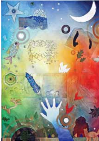
Los Cinco Elementos watercolor 30" x 22" 2012